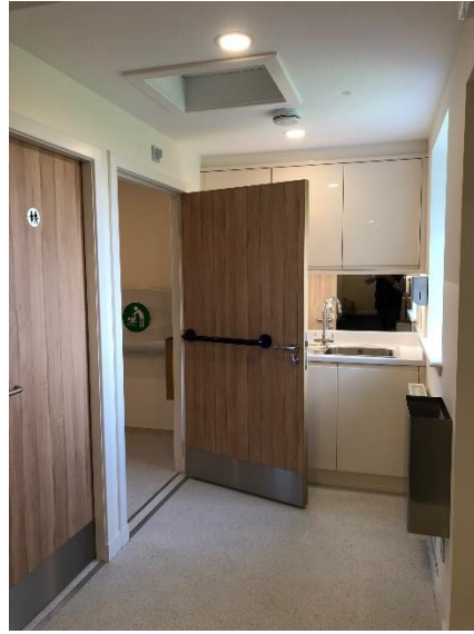
Fire Exit and window